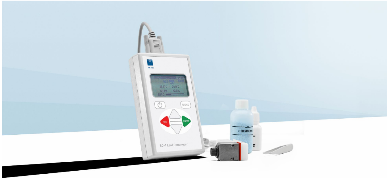
The METER SC-1 leaf porometer measures stomatal conductance