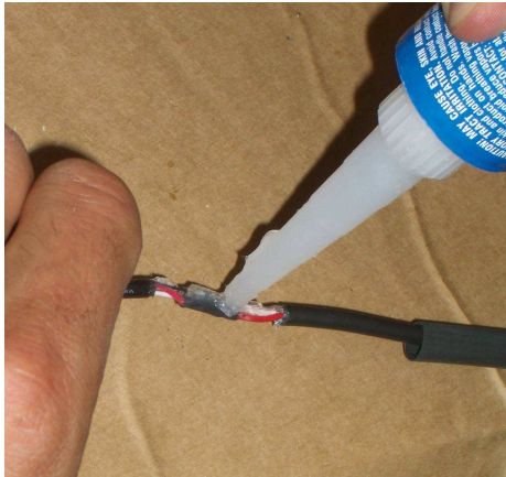
Figure 5 – 100% Silicone is used to seal and keep moisture out of the connection.