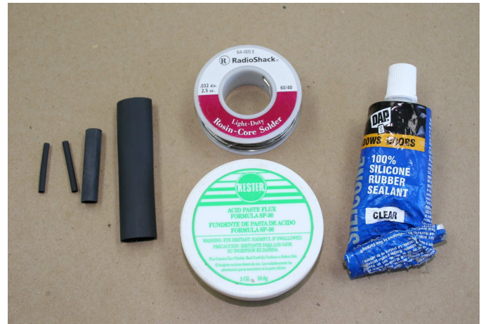
Figure 1 – Wire strippers, wire cutters, soldering iron, heat gun (A), heat shrink tubing, rosin-core solder, flux paste, and silicone rubber sealant used for wire splicing (B).