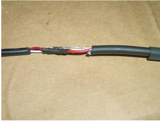
Figure 4 – All three wires soldered, covered, and prepped for sealing.