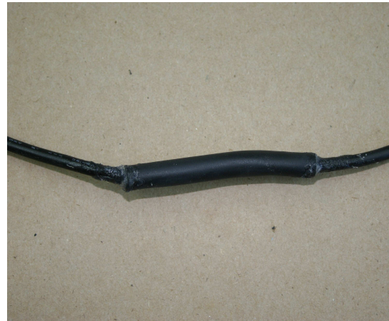
Figure 6 – Heat shrink tubing with silicone over the entire connection (A); the final product (B).