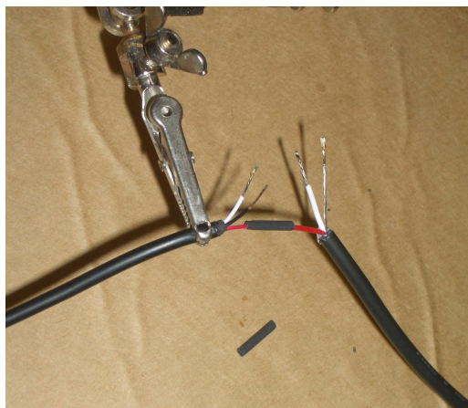
Figure 3 – Small wire lead soldered, covered with heat shrink, and with no bare wire showing.